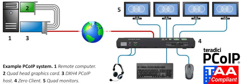
Example PCoIP system. 1 Remote computer. 2 Quad head graphics card. 3 DXH4 PCoIP host. 4 Zero Client. 5 Quad monitors.

The zero client then decrypts and decompresses the data, and delivers it to the desktop monitors and peripherals (such as keyboard, mouse, speakers or headset). The zero client also passes user-generated USB and audio data to the PCoIP host. The result for the user is that the desktop looks and feels like it is at their desk. Because zero clients simply decode pixels to display images, they are simpler and more secure than a traditional PC and other thin client solutions.